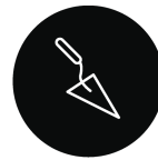
Damp Proof Course