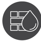
Damp Proof Membrane